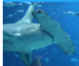
School of Hammerhead Sharks