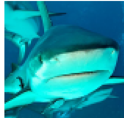
Grey Reef Shark

There are more than 500 different species of shark, including the great white shark, grey reef shark, hammerhead shark, tiger shark, blue shark, bull shark and mako shark. Sharks have five to seven gill slits on the sides of their head.